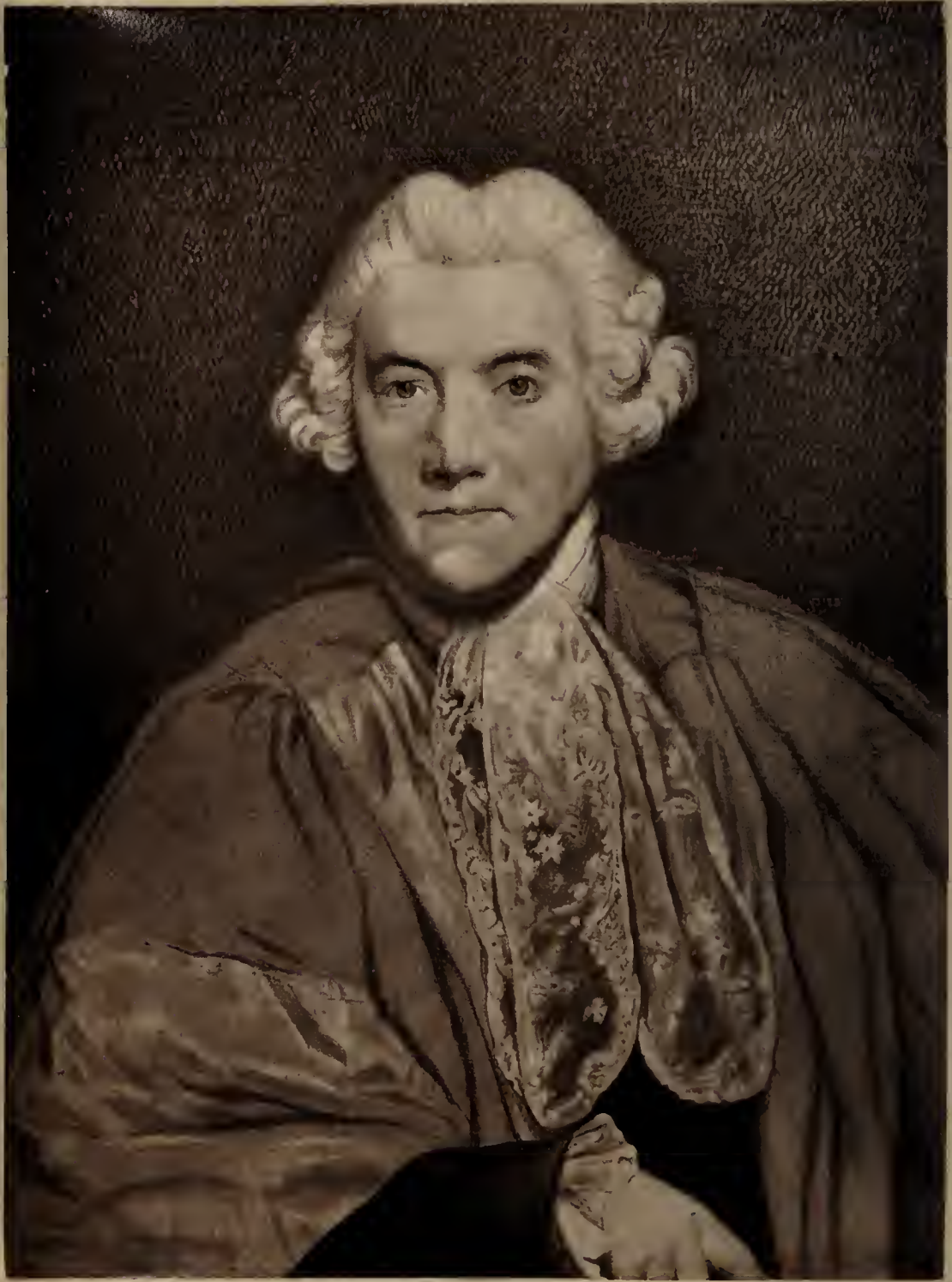
FROM A PAINTING BY SIR JOSHUA REYNOLDS.

I kiss all my dear Children, no man ever had better.